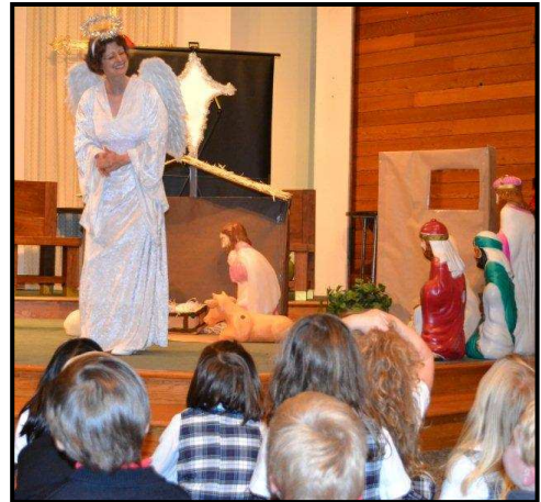
Donna's Divine Storytime for K4 and K5 students